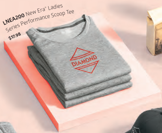
LNEA200 New Era® Ladies Series Performance Scoop Tee $17.98