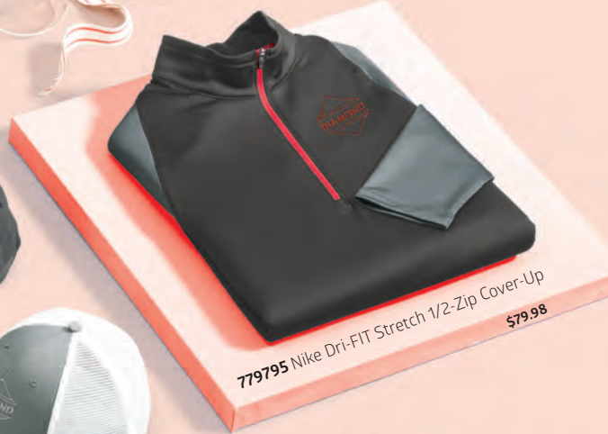
779795 Nike Dri-FIT Stretch 1/2-Zip Cover-Up $79.98