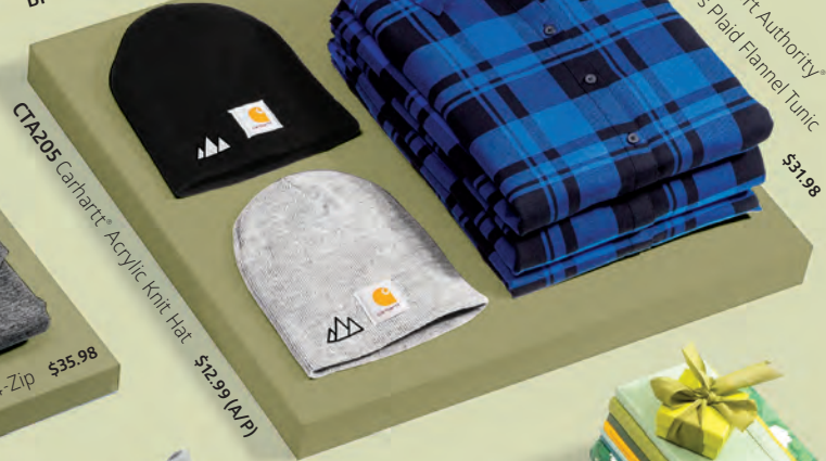
CTA205 Carhartt® Acrylic Knit Hat $12.99 (A/P)