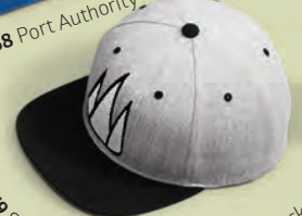
STC19 Sport-Tek® YuPoong Flat Bill Snapback Cap $9.98-13.98*