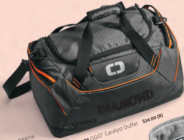
95001 OGIO® Catalyst Duffel $34.00 (R)