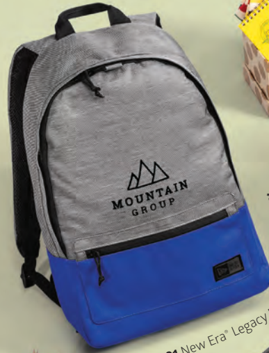
NEB201 New Era® Legacy Backpack $49.00 - $83.00