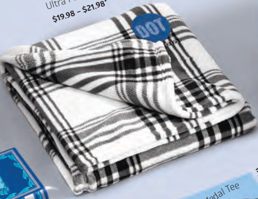
BP31 Port Authority® Ultra Plush Blanket $19.98 - $21.98*