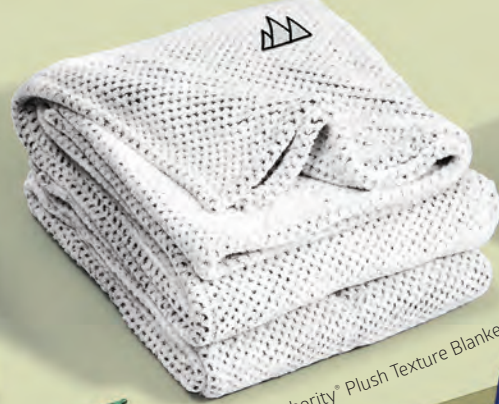
BP35 Port Authority® Plush Texture Blanket $29.98 - $33.98*