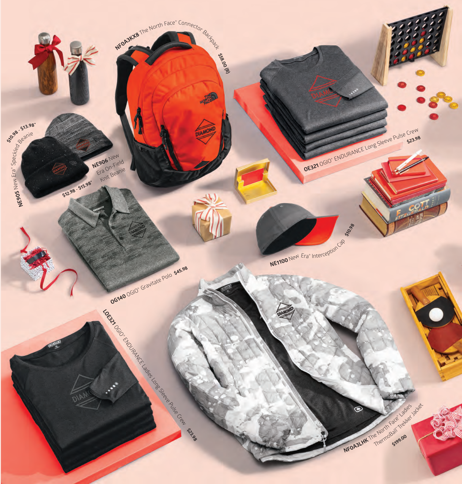
NF0A3KX8 The North Face® Connector Backpack $88.00 (R)