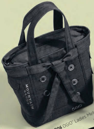
414006 OGIO® Ladies Melrose Tote $70.00 - $74.00*