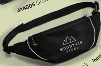
BG905 Port Authority® Hip Pack