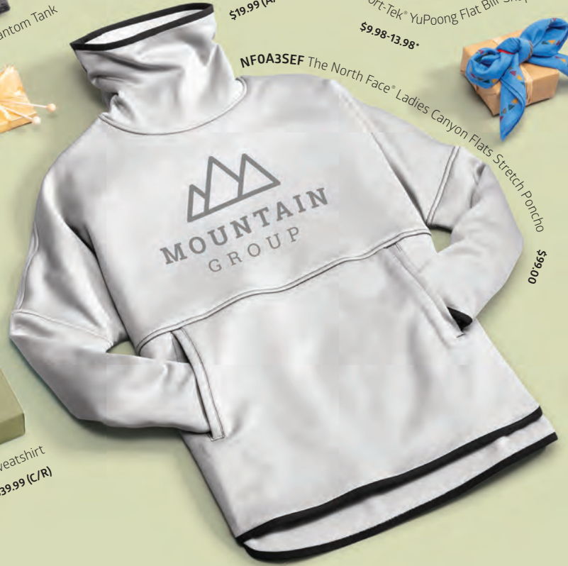
NFOA3SEF The North Face® Ladies Canyon Flats Stretch Poncho $99.00