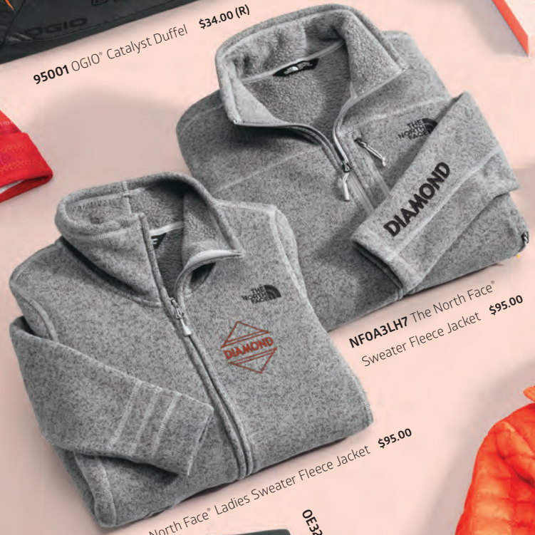
NFOA3LH7 The North Face® Sweater Fleece Jacket $95.00