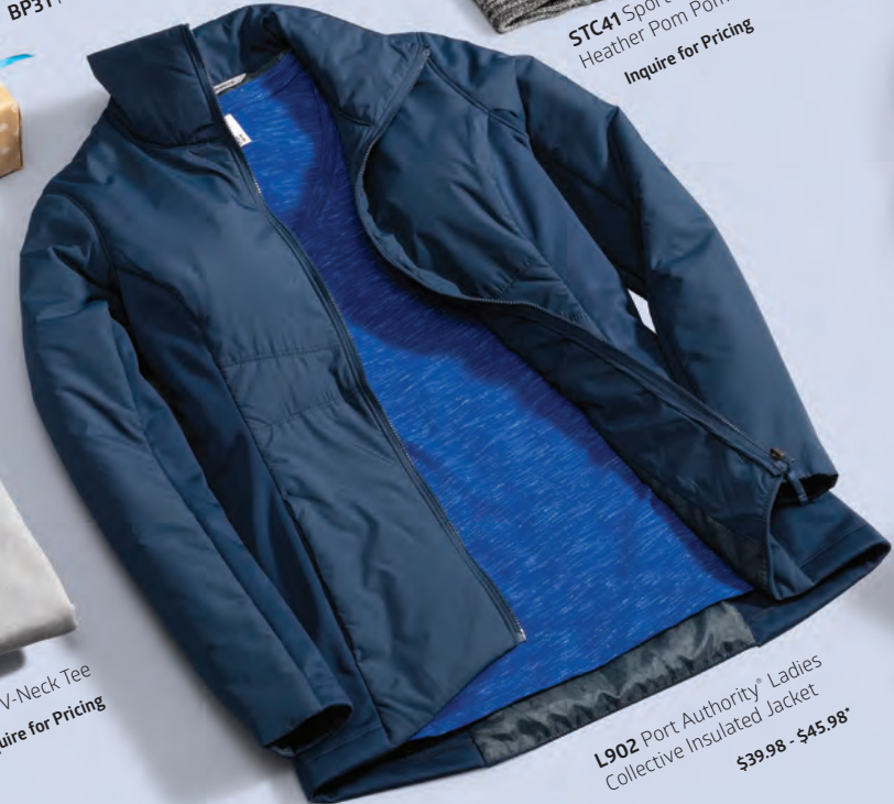
L902 Port Authority® Ladies Collective Insulated Jacket $39.98 - $45.98*