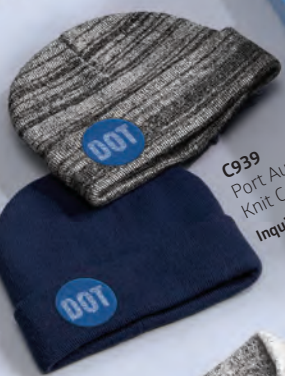
C939 Port Authority® Knit Cuff Beanie Inquire for Pricing