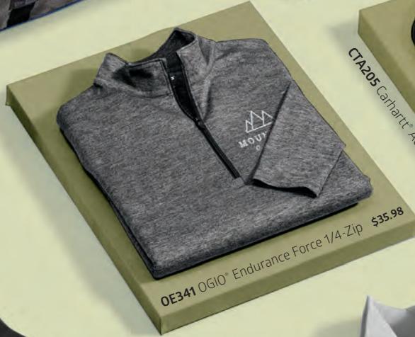
OE341 OGIO® Endurance Force 1/4-Zip $35.98