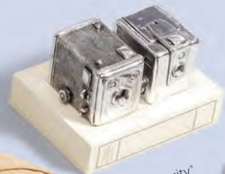
BP75 Port Authority® Packable Travel Blanket $25.98 - $29.98*