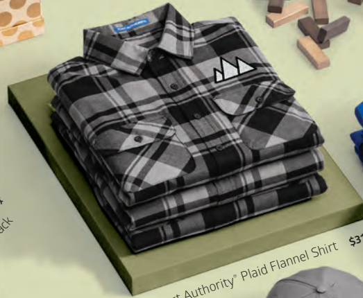
W668 Port Authority® Plaid Flannel Shirt $31.98