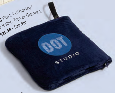
BP75 Port Authority® Packable Travel Blanket $25.98 - $29.98*