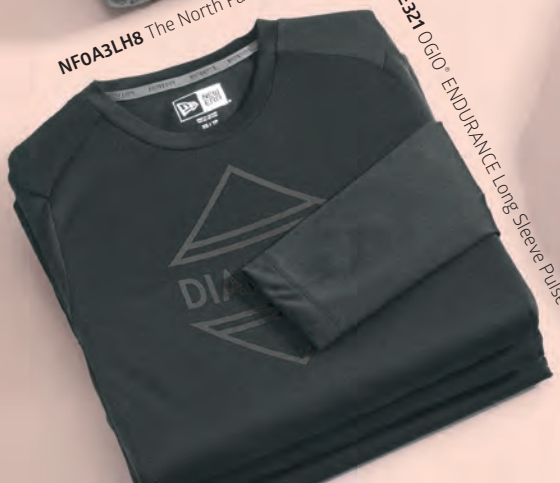
OE321 OGIO® ENDURANCE Long Sleeve Pulse Crew $23.98