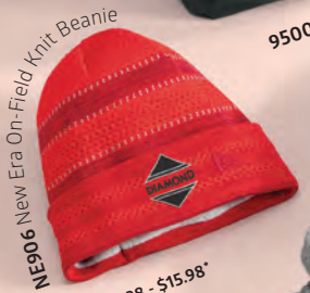
NE906 New Era On-Field Knit Beanie $12.98 - $15.98*