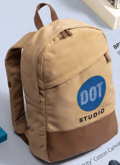
BG210 Port Authority® Cotton Canvas Backpack $33.98 - $36.98*