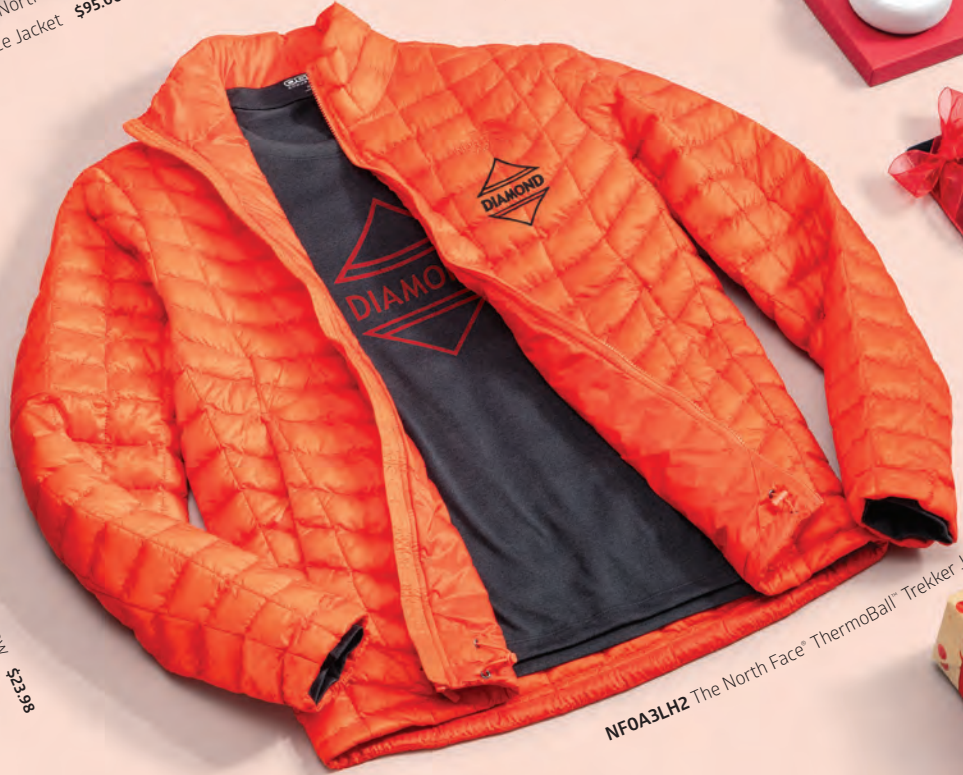
NFOA3LH2 The North Face® ThermoBall® Trekker Jacket $199.00