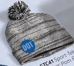
STC41 Sport-Tek® Heather Pom Pom Beanie Inquire for Pricing