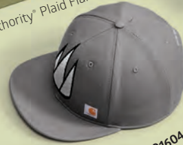
CT101604 Carhartt® Ashland Cap $19.99 (A/P)