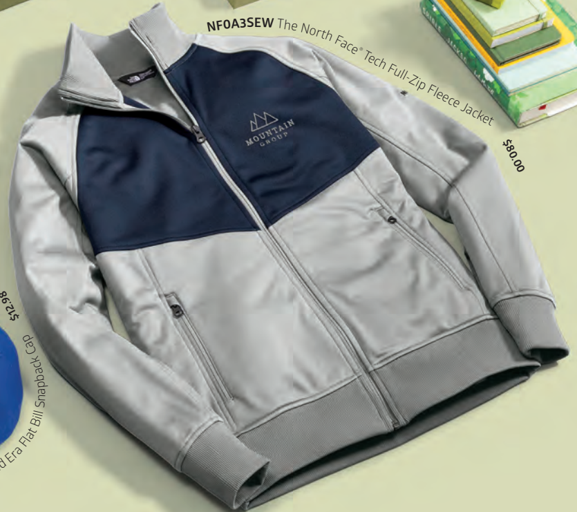
NFOA3SEW The North Face® Tech Full-Zip Fleece Jacket $80.00