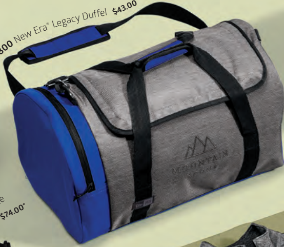
NEB800 New Era® Legacy Duffel $43.00