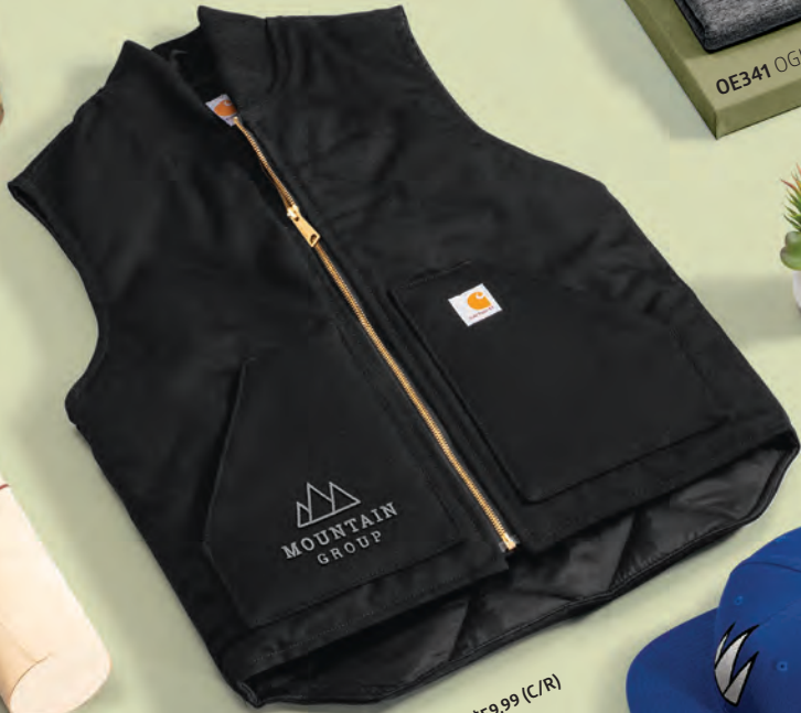
CTV01 Carhartt® Duck Vest $59.99 (C/R)