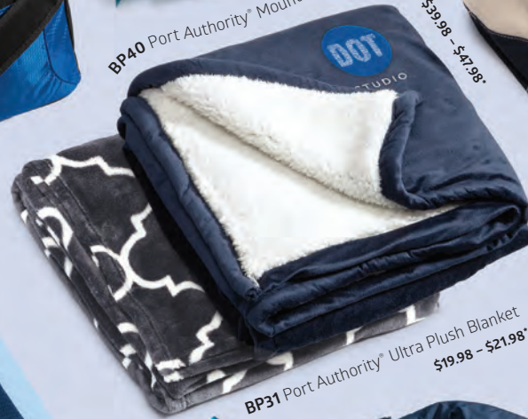
BP40 Port Authority® Mountain Lodge Blanket $39.98 - $49.98*