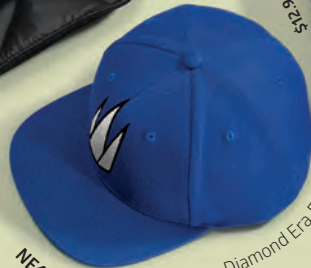
NE404 New Era® Original Fit Diamond Era Flat Bill Snapback Cap