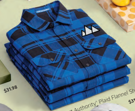
W668 Port Authority® Plaid Flannel Shirt $31.98