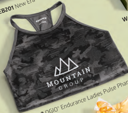
LOE323 OGIO® Endurance Ladies Pulse Phantom Tank $6.95