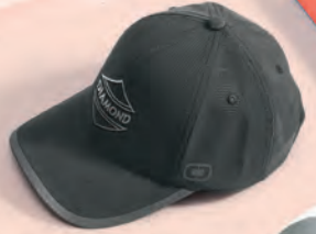
OG601 OGIO® Flux Cap $12.98