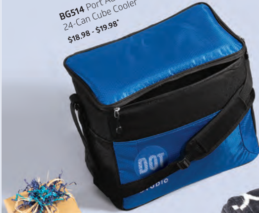
BG514 Port Authority® 24-Can Cube Cooler $18.98 - $19.98*