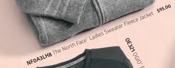
NFOA3LH8 The North Face® Ladies Sweater Fleece Jacket $95.00