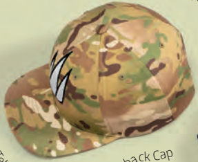
Sport-Tek® YuPoong Flat Bill Snapback Cap $9.98-13.98*