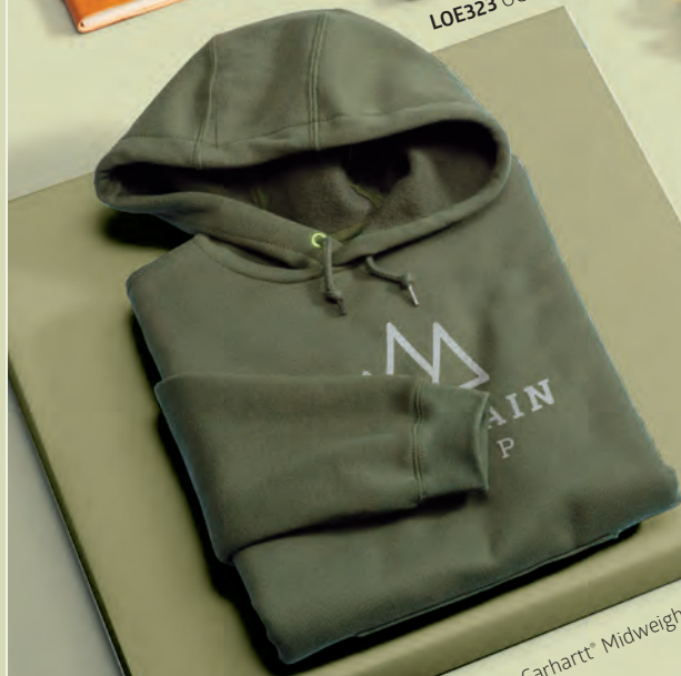
CTK121 Carhartt® Midweight Hooded Sweatshirt $39.99 (C/R)