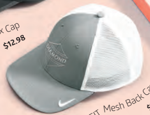
NKA09293 Nike Dri-FIT Mesh Back Cap $21.98