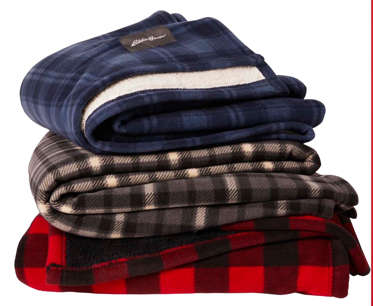
EB750 Eddie Bauer® Woodland Blanket | 3 colors